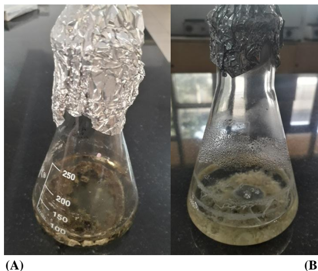
Fig. 2: Dissolution of TCP by (A) Aspergillus niger and (B) Penicillium at pH 6 in PVK broth